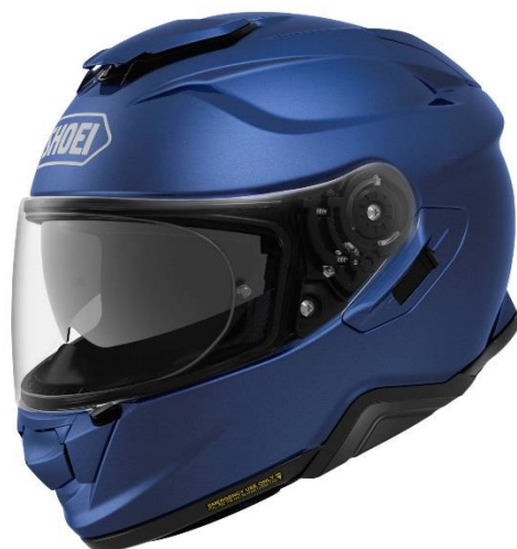
MATT BLUE METALLIC