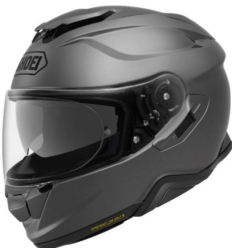
MATT DEEP GREY